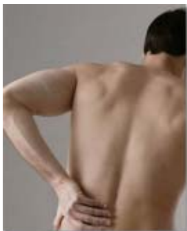
Acupuncture is an effective treatment for low back pain.

Primary outcome was response after 6 months, defined as 33-percent improvement or better on three pain-related items on a chronic pain questionnaire or 12-percent improvement or better on a back-specific questionnaire.