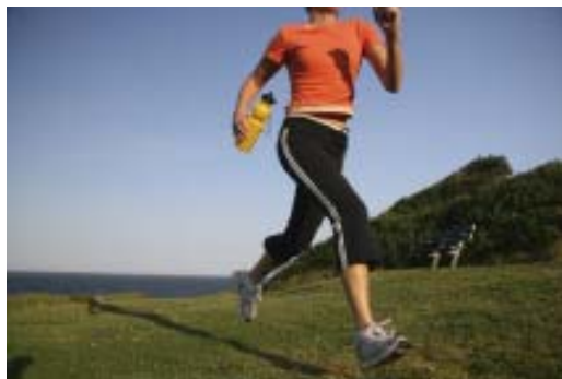
Functional retraining is often the critical element necessary for return to sport, work, and recreation.